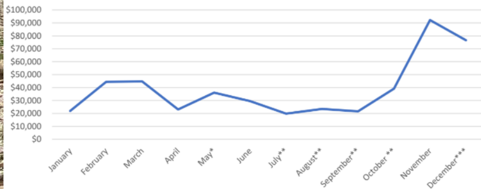
Operation Cash Flow for 2020